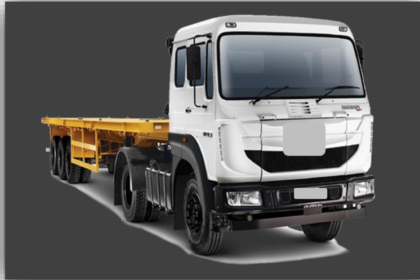
Top Left FLAT BED TRAILER