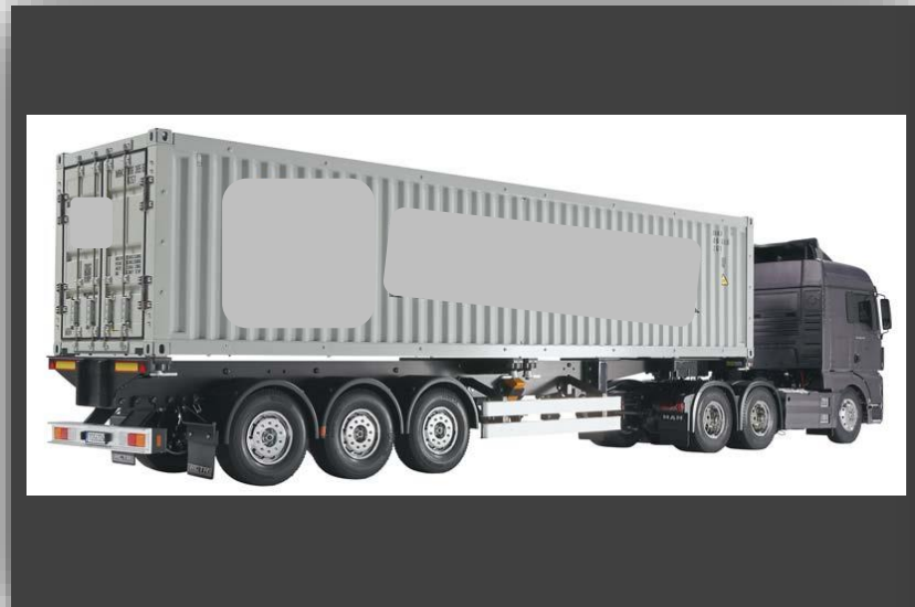
Bottom Left CONTAINER TRAILER