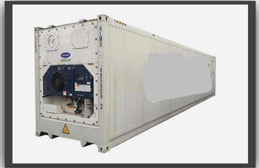
Top Right REFRIGERATED CONTAINER