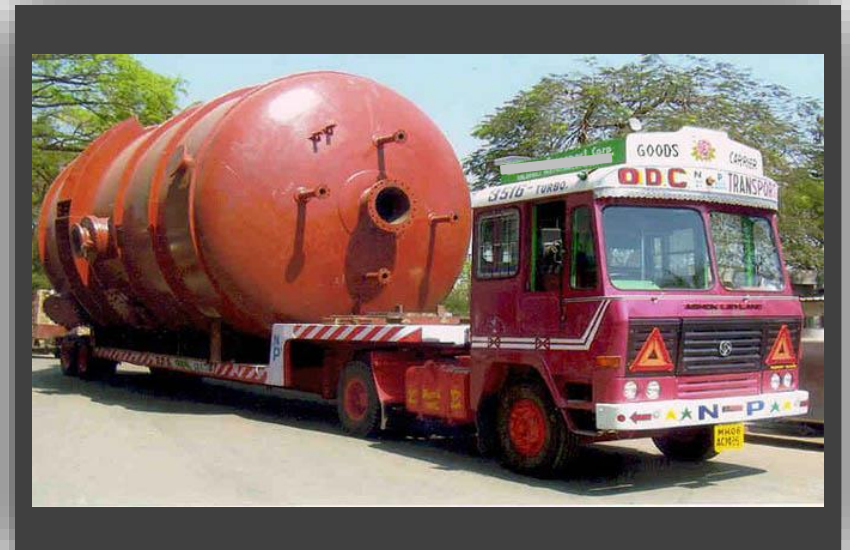
Bottom Right ODC on FLAT BED